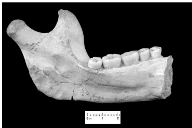
Fig. 2. Medial view of ATD6-96.

ATD6-96 lacks an alveolar prominence and a torus mandibularis. As in ATD6-5, the mylohyoid line is defined by a step between the flat and vertical subalveolar plane and a moderately hollowed subalveolar fossa. The mylohyoid line runs from just below the trigonum postmolare forwards and downwards to