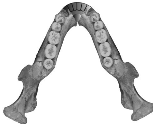
Fig. 3. Photographic restoration of ATD6-96: occlusal view. The original photograph was transformed into a drawing, manipulated in PHOTOSHOP (Adobe Systems, San Jose, CA), and then edited by DRAW (Corel, Ottawa, Canada).

The posterior teeth are relatively small in comparison to those of Hominid 1 from TD6, the holotype of H. antecessor (15). ATD6-96 shows the P3 > P4 and M1 < M2 size sequences. The crown of P3 is asymmetrical and exhibits a vestige of buccal cingulum. P4 shows a moderately developed talonid. As seen in a computerized tomography scan, both premolars have a single